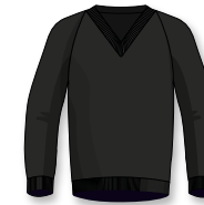
• Black long-sleeved V-neck pullover