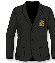
• School blazer with badge