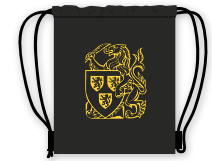
• Black and gold drawstring gym/boot bag

White short-sleeved shirt (summer only) Navy or black jacket, raincoat or anorak Navy or black scarf and gloves Black and gold striped School scarf Black and gold drawstring gym/boot bag