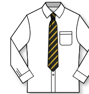
• White long-sleeved shirt