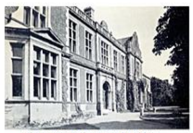
The Upper Sunbury Road Building

For a variety of demographic and geographical reasons, maintaining this establishment proved increasingly beyond the financial means of the existing school trustees and the ability of the Headmaster to attract more and new pupils: despite Hammond's original wish that the vicar might 'teache children freely and repaire the howsing', staffing and running costs meant that the School had now to charge fees. Therefore, since the Middlesex County Council was under pressure to extend its provision for secondary education in the area, rather than make a completely new beginning, it agreed, following the publication of a new scheme of government in April 1910 , to become a controlling Trustee of the existing school. The School thus became Hampton Grammar School, a name which is still used by older residents in the local area.