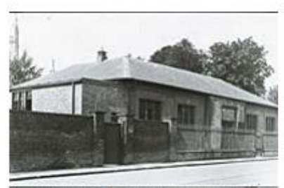
Hampton Public Hall 1926 (Formerly the