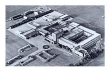
Aerial view of the current site in the 1940s – note the air-raid shelters

The Sunbury Road building and site were too constricted for the school to expand much beyond 500 pupils. Therefore, following lengthy deliberations, the School moved in 1939 to new, larger accommodation on the Hanworth Road, where it remains today. The land here, commonly known as Rectory Farm, had also come to the School to compensate for the loss of rectorial tithes. Some of this land, not needed by the School, was sold to the Lady Eleanor Holles School and to the County Council to build the Rectory Secondary Modern School (now Hampton High). There are therefore three schools today in the Hanworth Road.